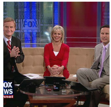
Fox & Friends