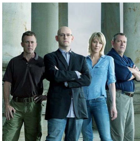
Brad Meltzer's Decoded